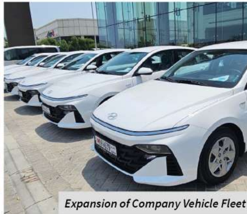
Expansion of Company Vehicle Fleet