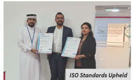
ISO Standards Upheld