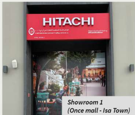
Showroom 1 (Once mall - Isa Town)