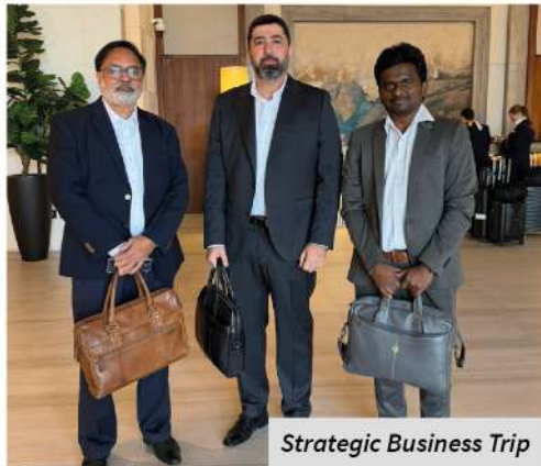
Strategic Business Trip