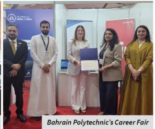
Bahrain Polytechnic's Career Fair