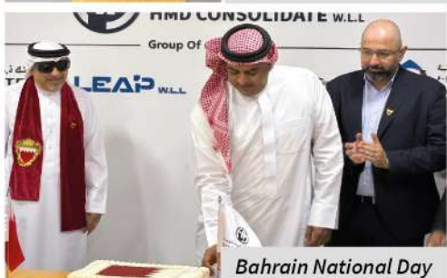
Bahrain National Day