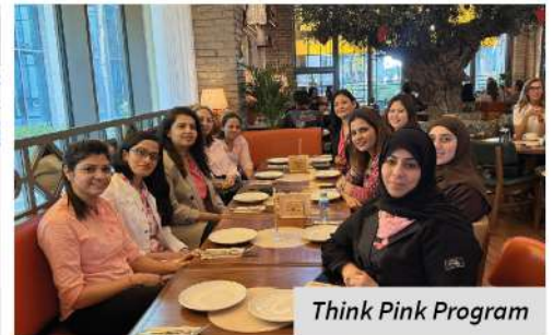
Think Pink Program