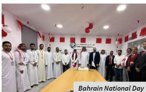
Bahrain National Day