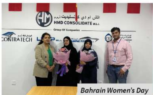
Bahrain Women's Day