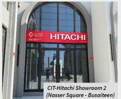
CIT-Hitachi Showroom 2 (Nasser Square - Busaiteen)