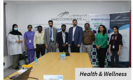
Health & Wellness