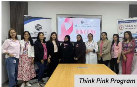
Think Pink Program