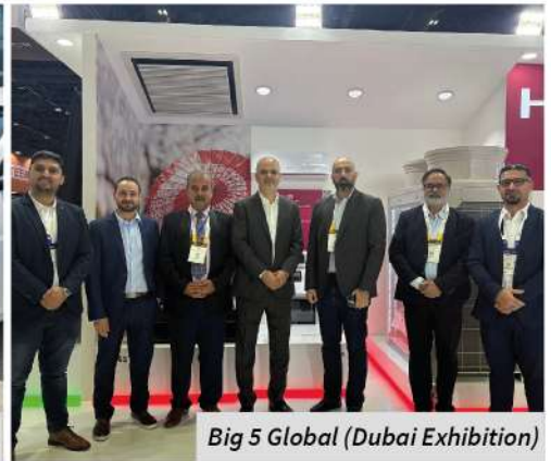
Big 5 Global (Dubai Exhibition)