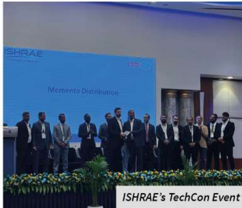
ISHRAE's TechCon Event

As part of our 2025 achievements, this partnership stands as a testament to our collective efforts, strategic focus, and dedication to delivering value through collaboration and excellence.