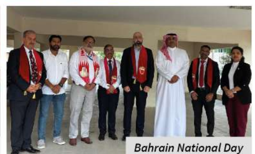
Bahrain National Day